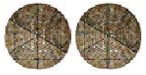
H - Tower (blocking)