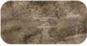
A - Rubble (hindering)