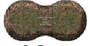
I - Butte (blocking)