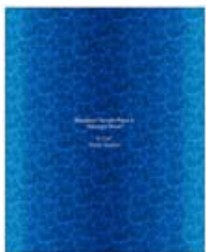
L - Straight River (water)