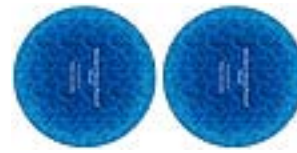
R - Pond (water)