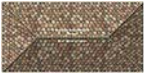
F - House (blocking)