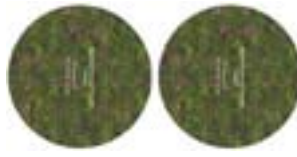
B - Copse (hindering)