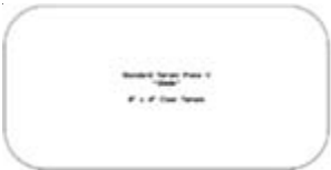
V - Glade (clear)