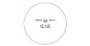
W - Dell (clear)