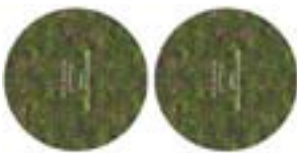
U - Sedge (concealing)