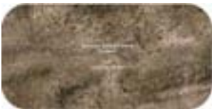
T - Scrub (concealing)