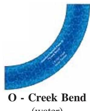
O - Creek Bend (water)