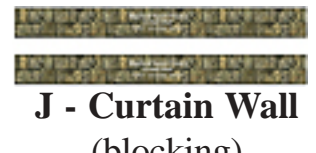
J - Curtain Wall (blocking)