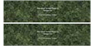
D - Hedgegrow (hindering)