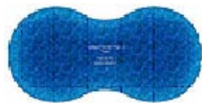
S - Tarn (water)