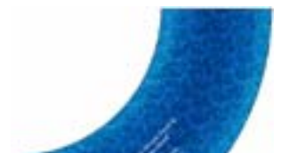
Q - Stream Bend (water)

NOTE: Terrain Templates E (Gatehouse) , and K (Low Wall) are no longer Tournament Legal terrain pieces.