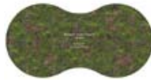
C - Brush (hindering)