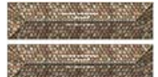
G - Longhouse (blocking)