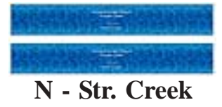
N - Str. Creek (water)